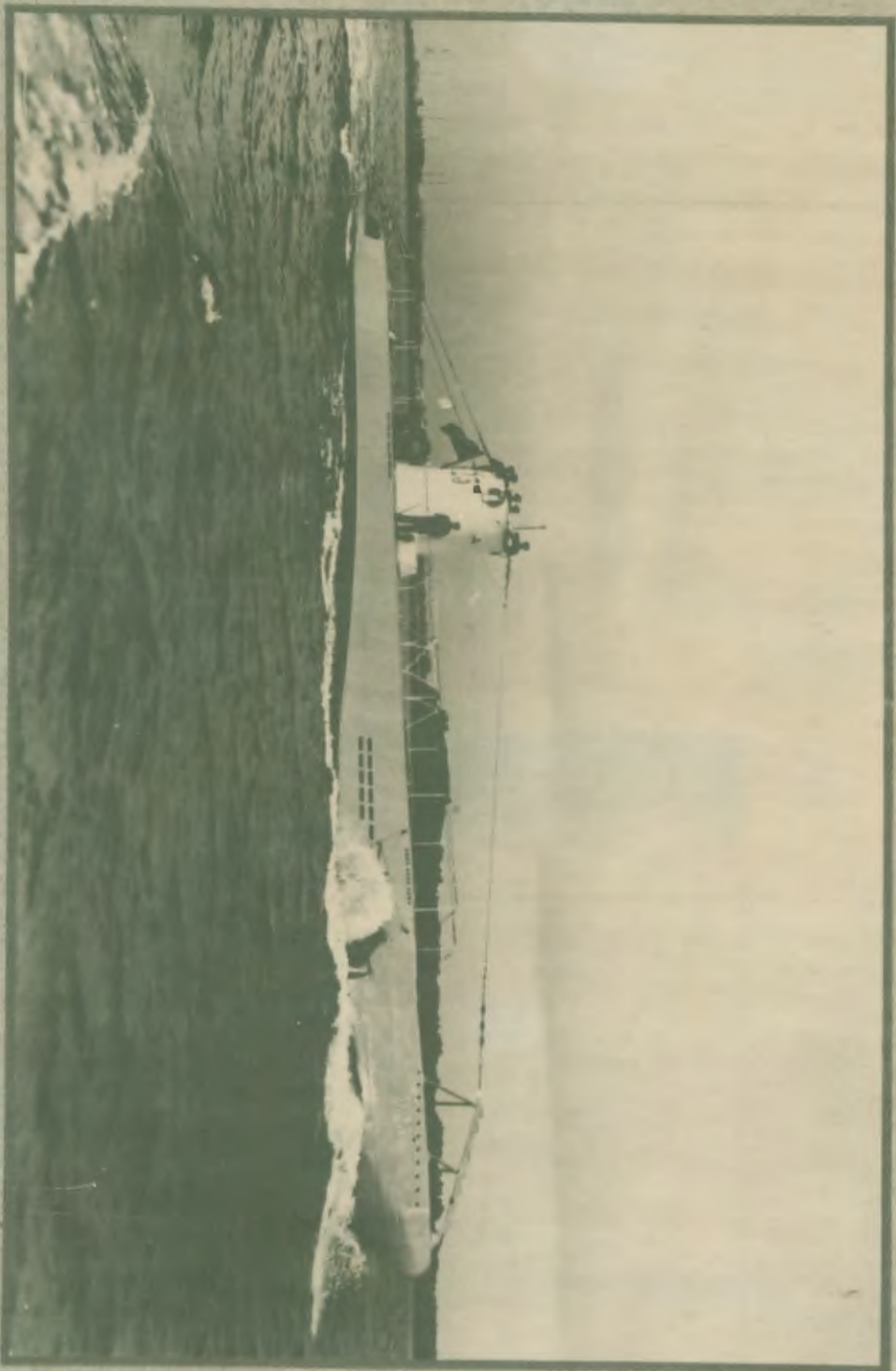
NU 23 - ein Boot der U-Flottille "Lohr" 250 t Baujahr 1935