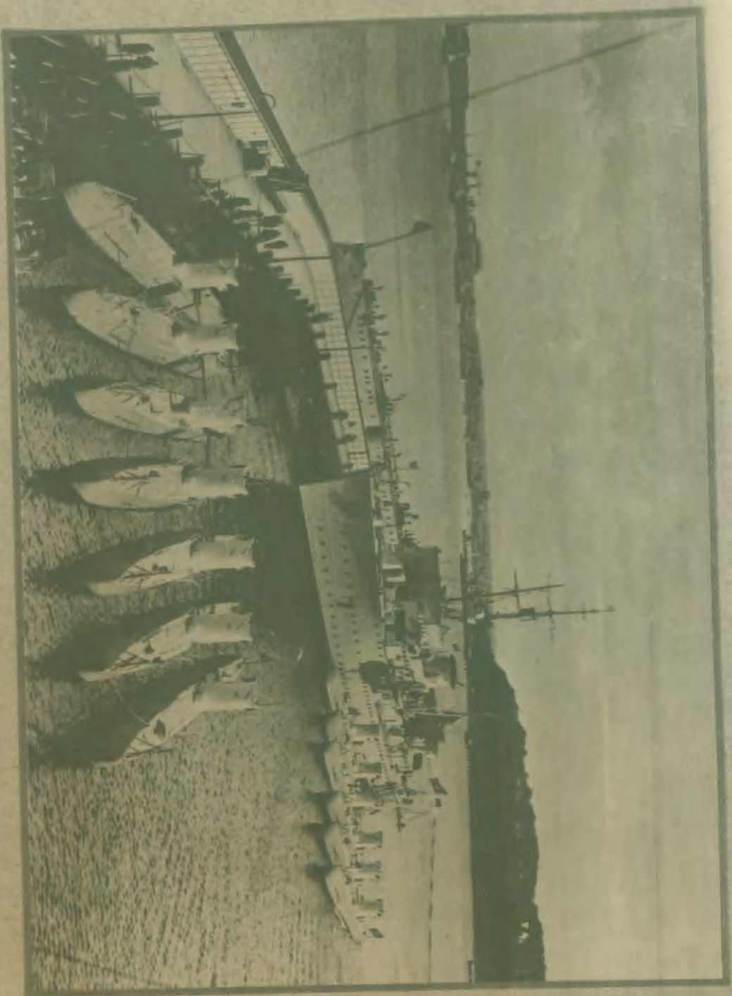
V-Flottille "Weddigen" mit ihrem U-Bootsbegleitschiff "Saar" Baujahr 1935