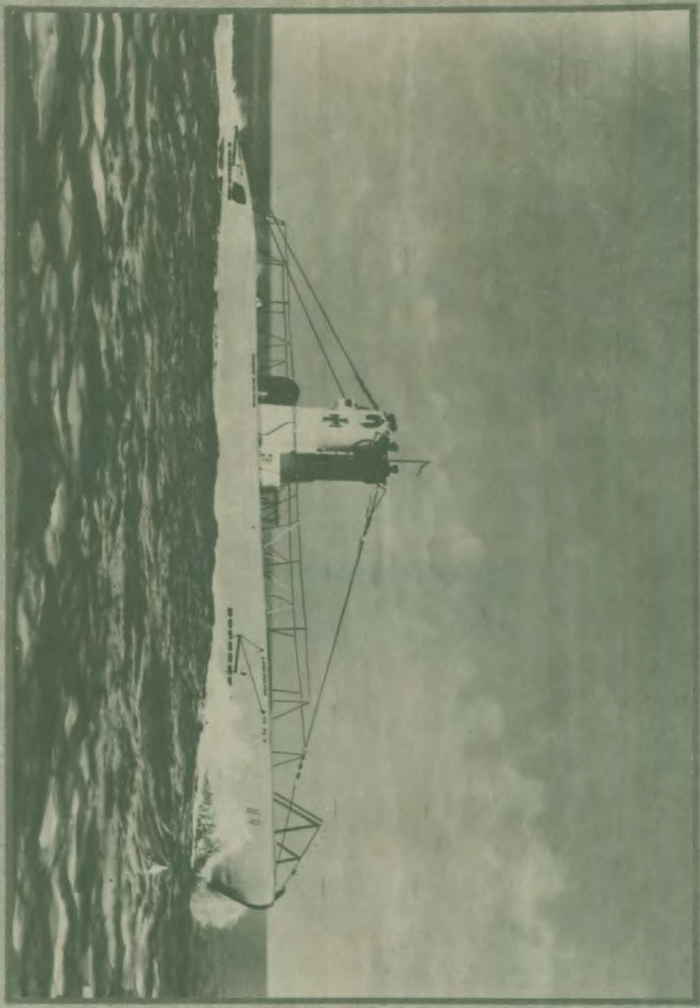
NU 9 u - das Traditionsboot der U-Flottille "Weddigen" 250 t Baujahr 1935