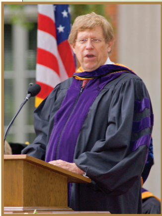
Former U.S. Solicitor General and 2005 Georgia Law Commencement Speaker Ted Olson