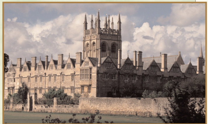
The law school will debut an ABA-accredited semester study abroad at Oxford this spring.

As you are aware, today's legal professionals are being tested more and more frequently on their familiarity with international issues. In addition to the school's successful LL.M. program, Georgia Law has been expanding its international curricular and co-curricular offerings. Since 2001, the International Externship Program has grown fivefold. This past summer, 11 students worked for entities in the countries of Belgium, Brazil, China, Colombia, Germany, Ghana, Guyana and India.