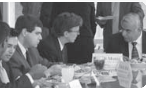
Clockwise from top; The Chief Justice and other distinguished members of the delegation from India at the Hatton Lovejoy courtroom discussing individual rights in India; meeting with the directors of the Rusk Center; at a luncheon with School of Law faculty members.