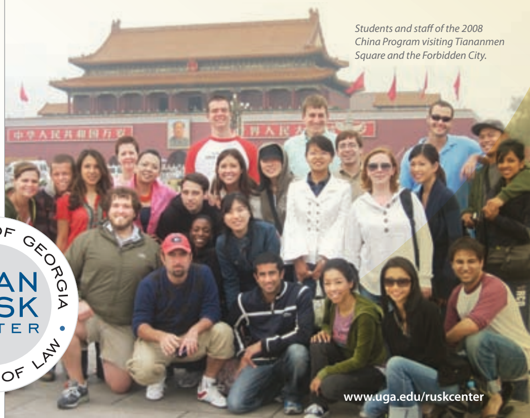
Students and staff of the 2008 China Program visiting Tiananmen Square and the Forbidden City.