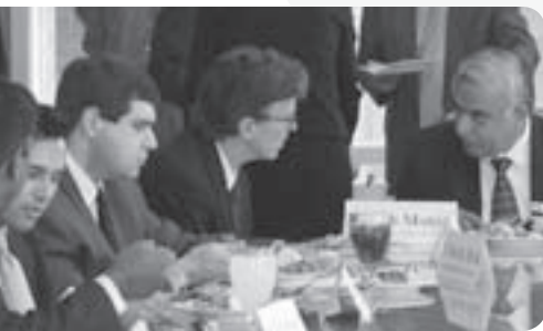
Clockwise from top; The Chief Justice and other distinguished members of the delegation from India at the Hatton Lovejoy courtroom discussing individual rights in India; meeting with the directors of the Rusk Center; at a luncheon with School of Law faculty members.