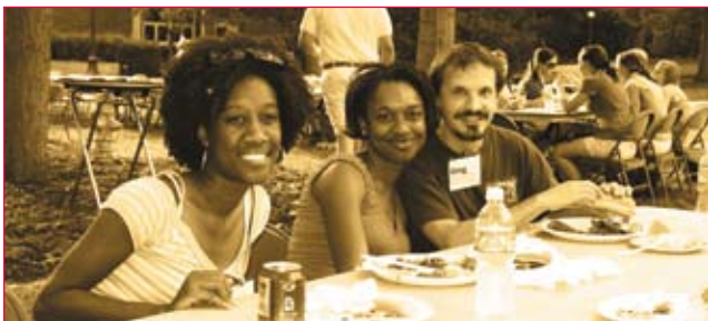
Members of the entering Class of 2008, one of the most academically talented classes in the school's history, enjoyed a cookout during orientation.

The entering Class of 2008 represents a diverse as well as an accomplished group of students. For the second time in School of Law history, the majority of the first-year class is