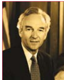
Former U.S. Sen. Wyche Fowler led a course on the U.S. Congress and the Constitution as a Sanders Scholar in the spring of 2008.