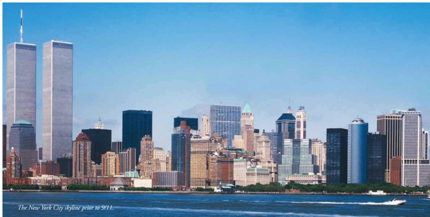
The New York City skyline prior to 9/11.

Roving surveillance of individuals in drug cases and racketeer-