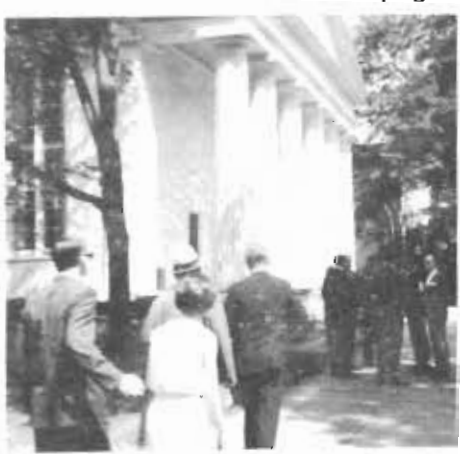
Alumni and Students arrive for Law Day