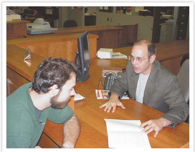
The new reference area is better able to accommodate private consultation between librarians and researchers.