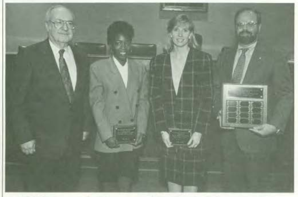
1990 Awards Presented in Beaird Competition

Your professional contribution and personal sacrifice is invaluable and greatly appreciated. Thank you!