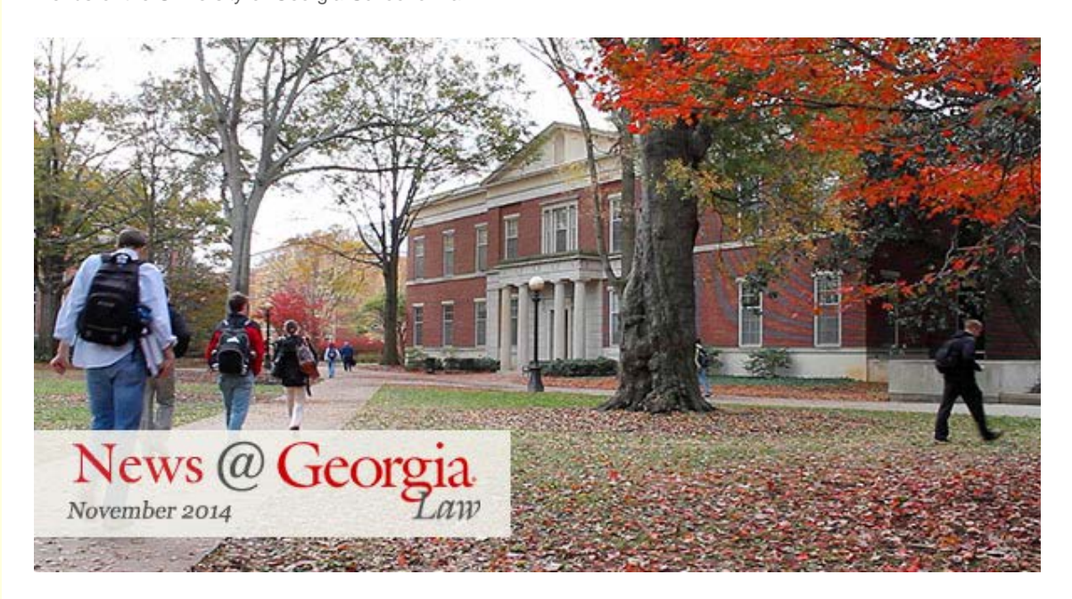
News @ Georgia Law is a quarterly e-newsletter for alumni and friends of the University of Georgia School of Law.