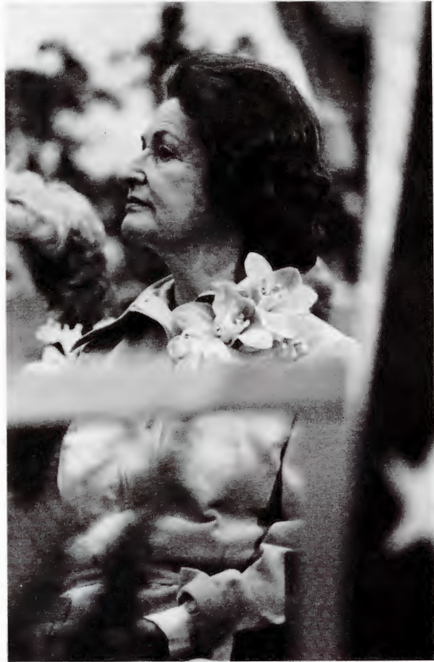
Lady Bird Johnson