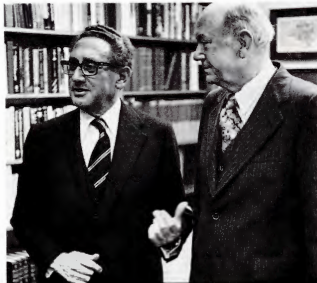
Two former U.S. Secretaries of State spend a few moments deliberating on strategies for world peace or other topics approachable only by those whose common diplomatic decision-making and crisis-handling experiences qualifies them in a unique manner. Henry Kissinger visited the University campus in February as keynote speaker for the UGA Alumni Seminar on the Soviet Union. He toured the Rusk Center for International and Comparative Law and had breakfast with Professor Rusk, who introduced him at the Alumni Seminar. Mr. Kissinger's appearance marks the second time a U.S. Secretary of State has visited the School of Law in ten months. Secretary Vance came to Athens in April 1977 as Law Day speaker.

The current $3,000,000 development program to raise private funds for additional scholarships, endowed chairs, special educational programs, and to assist in establishing and enriching the Dean Rusk Center for International and Comparative Law, has been designated as "The Talmadge Fund" to honor one of Georgia's most illustrious senators and his family. United States Senator Herman E. Talmadge, son of the late Governor Eugene Talmadge, was born and reared in Georgia and is a graduate of The University of Georgia School of Law. Now in his twenty-first year as a U.S. Senator from Georgia, he previously served as Governor of the state during which time Georgia rose to the forefront in industrial expansion, rural road building and natural resources conservation.