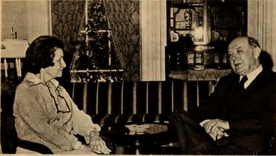
Mrs. LBJ reminisces with the man her husband called "the decade's man of the ages."