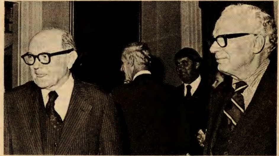
Former Undersecretary of State George Ball was Rusk's "alter ego" at the State Department, Rusk Ball's "mentor," according to each other's descriptions.