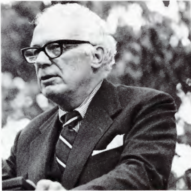
George W. Ball was U.S. Undersecretary of State from 1961-1966. In this capacity he served as deputy and personal friend to Dean Rusk during an important period of U.S. history. He was invited to the dedication ceremony to add his personal reflections on Rusk's achievements and character.