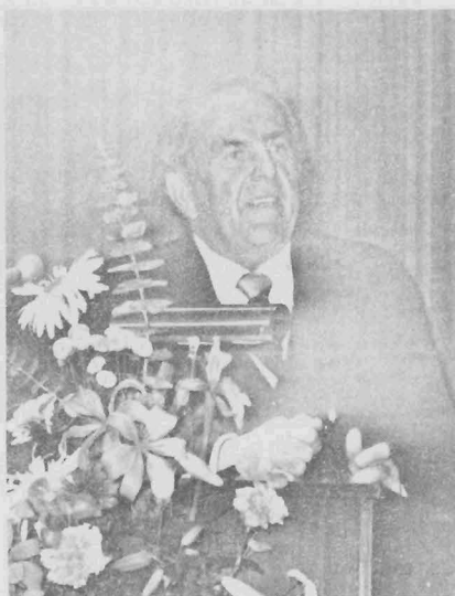
Judge Abner J. Mikva