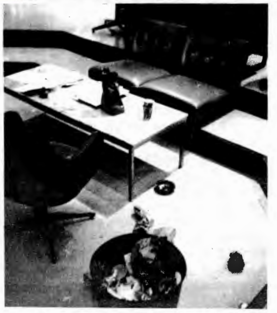
Two Points For Hitting Basket