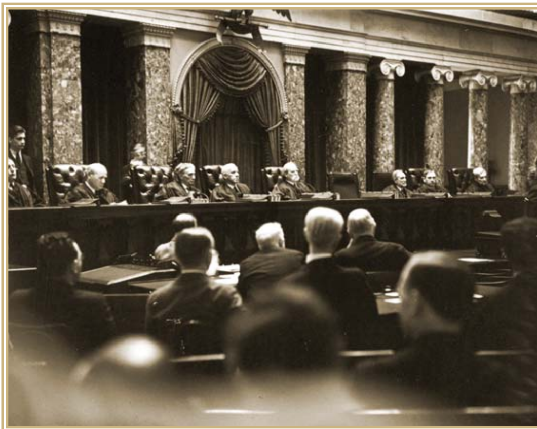
Left – This photograph, which was published in Fortune, was promoted as the first image ever of the Supreme Court in session. It was taken in 1932 when renowned photographer Erich Salomon had snuck a camera into an oral argument that was held in “The Old Senate Chamber” by faking a broken arm and hiding his camera in the sling.