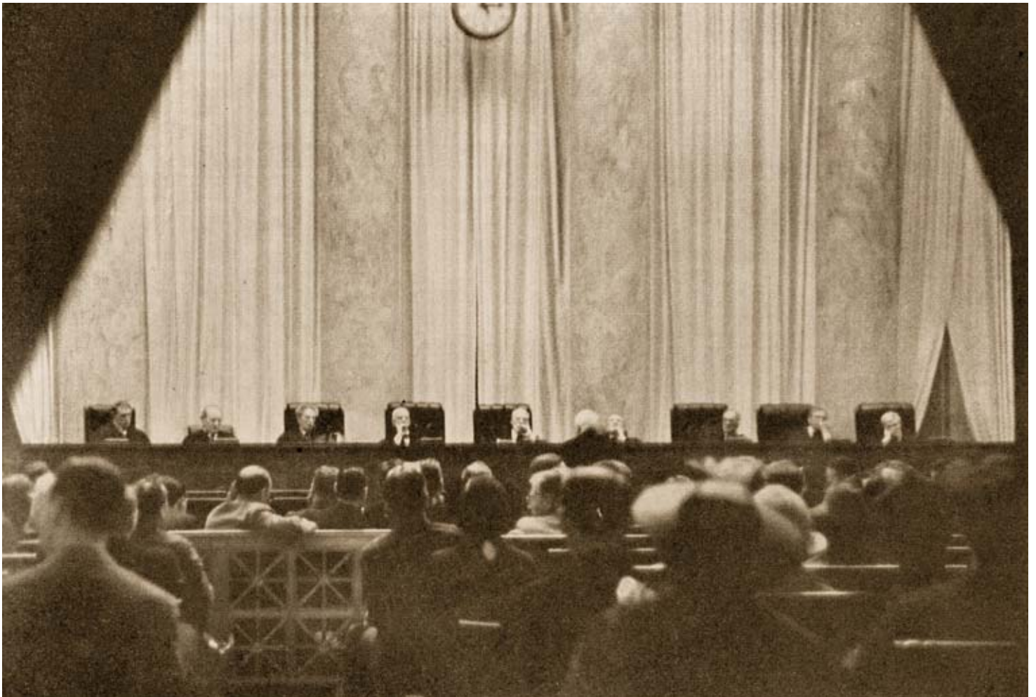
Above – This rare 1937 photograph of the Supreme Court in session is not very well known. It ran in Time magazine after it was taken by an amateur photographer who concealed her camera in her handbag to capture the justices in action at the Supreme Court Building.