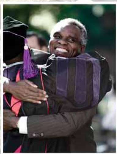
▲ A proud dad hugs his graduate.