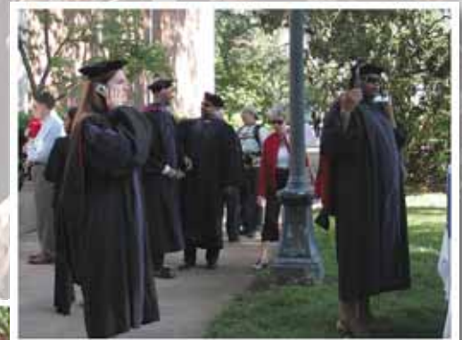
▲ Prospective graduates try to reach members of their family prior to commencement exercises.