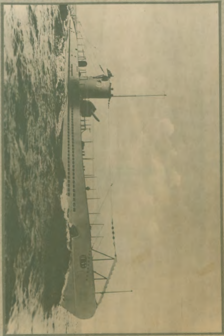
U 35" - ein Boot der U-Flottille "Saltsvedel" 500 t Baujahr 1935