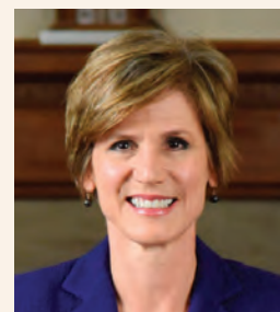
Georgetown Law Distinguished Lecturer from Government Sally Yates (J.D.’86)

University of Georgia School of Law Athens, GA 30602-6012 www.law.uga.edu