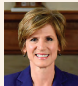
Georgetown Law Distinguished Lecturer from Government Sally Yates (J.D.’86)

University of Georgia School of Law Athens, GA 30602-6012 www.law.uga.edu