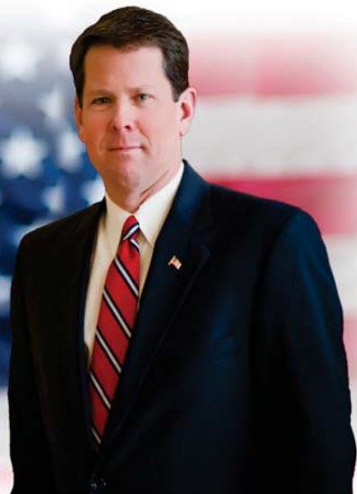
Brian P. Kemp Georgia Secretary of State