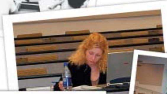
◀ Classrooms F and J now have windows, new tables, chairs and power access at every seat that enables students to use their laptops to take notes and study. ▼

Classrooms F and J not only received new desks, chairs and high-tech teaching podiums, they were also fitted with windows. The architects needed to make holes in the school's outside wall to remove and install the rooms' new fixtures. To close the holes, the architects put in two windows in each classroom. Classroom K in Dean Rusk Hall was also remodeled to match classrooms F and J with the exception of the windows.