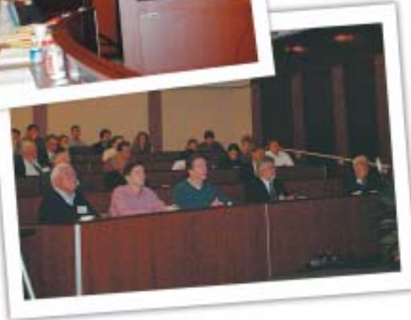
◀ Replacing the auditorium, classrooms A and B were first used this fall to host the "Problem in Discovery and Professionalism" conference. This annual legal ethics and professionalism conference is funded by a discovery violation settlement and is hosted by the four ABA-accredited Georgia law schools on a rotational basis.