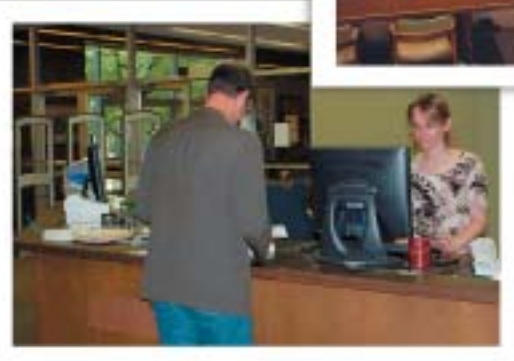
▲ The library's remodeled checkout area is equipped with an online catalog system (the old index cards seen in this photo at the lower right will soon be obsolete). The new security system's gates are also visible at the library's entrance on the left. Please see the editorial that accompanies this article for more information on the library's technological improvements.

The Alexander Campbell King Law Library's main reading room received new carpet and wall covering, a reconfigured checkout area and a long-awaited security system. This coming spring, new tables fitted with lamps and power access for every seat and new chairs will be installed in addition to signage bearing the room's new name, the Carl E. Sanders Reading Room.