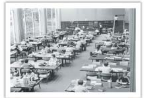
▲ The library's main reading room before renovation. For nostalgia, if you would like to own one of the original 10' x 4' wooden tables or chairs crafted in 1967, they are available by calling the Office of Development at (706) 542-7639 or by e-mailing lawgifts@uga.edu.