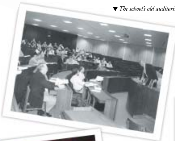
▼ The school's old auditorium.