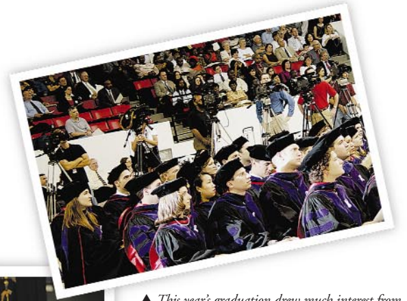
▲ This year's graduation drew much interest from the media, locally and nationally. As seen here, several broadcast cameras filmed the event. Covering the event was C-SPAN, Fox News, NBC Nightly News, CBS and ABC in addition to print media from Knight Ridder, Associated Press, the Fulton County Daily Report and the Atlanta Journal-Constitution.