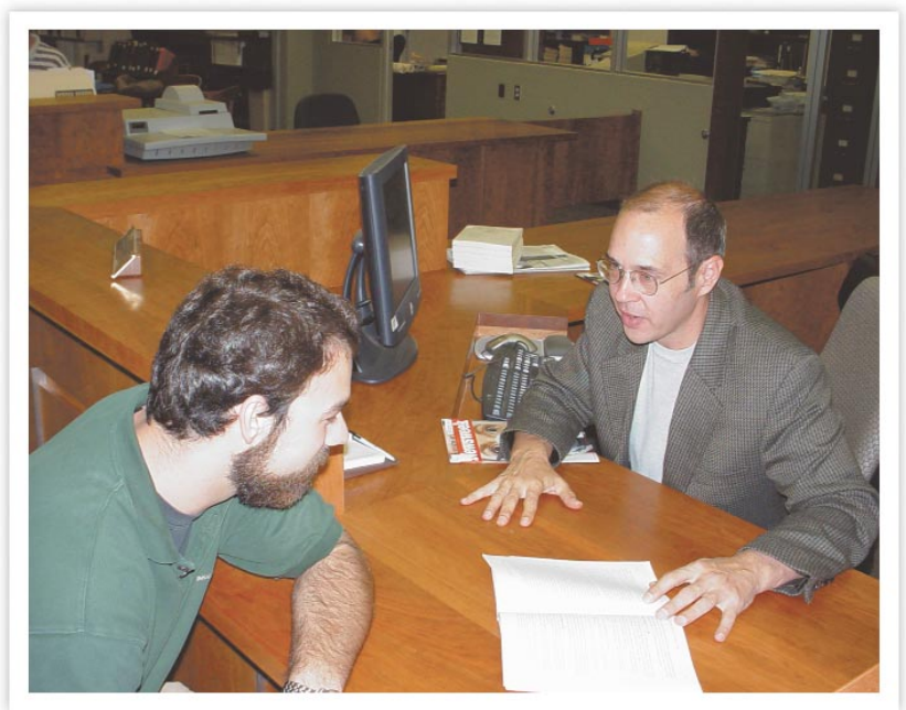
The new reference area is better able to accommodate private consultation between librarians and researchers.