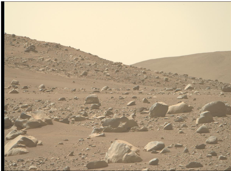
Figure 3.0: Mars Perseverance Sol 708, Voted by the Public as “Image of the Week” for Feb. 12–18, 2023 120

These Martian rocks lay scattered across a desolate landscape, under a dusty beige sky. In the vastness of space, we feel little need to ponder the legal ownership or title to these geological resources examined so closely by Perseverance. The questions of possession, use, and wealth seem remote and unknown. We should remember