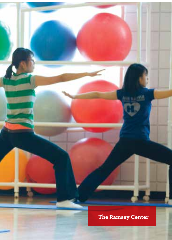
The Ramsey Center