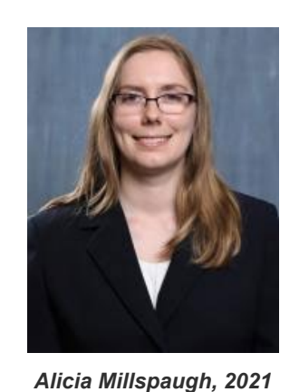
Law School Alumni Association Award for Exceptional Diligence and Dedication in the Study of Law, Class of 2021