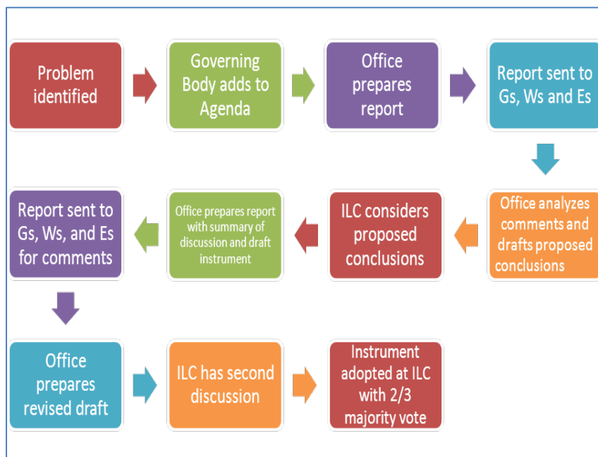
Box 1: The ILO's Double-Discussion Procedure

Within one year of its adoption, states must submit the new instrument to their national legislative bodies for potential ratification. 25 There is no obligation for ILO member States to ratify the Convention, but once having done so, they must accept all of the Convention's provisions because reservations are not permitted. 26 Furthermore, once a