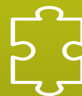
Image + Text + Data About 1 Subject Done Creatively

We are visually wired. overloaded with info, can process text & graphics faster